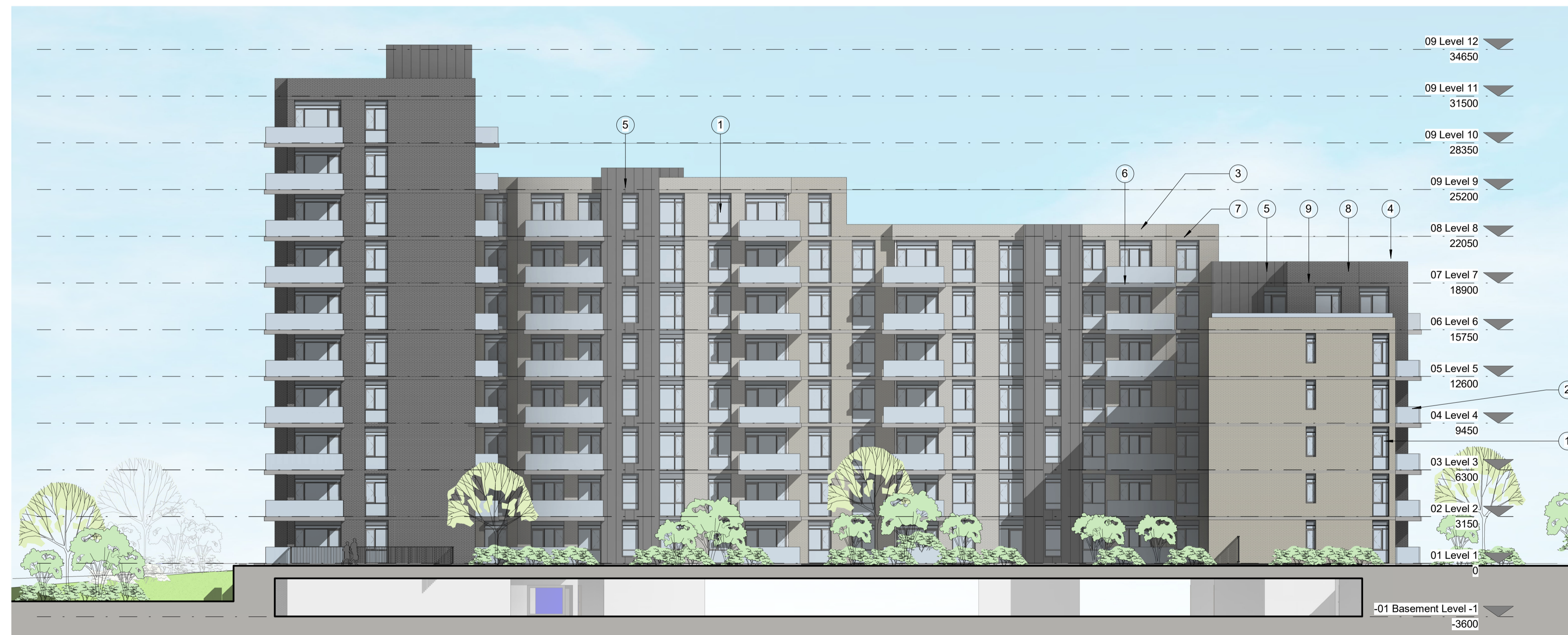
2 Sector 7 Block 3 West Elevation (2) 1 : 200